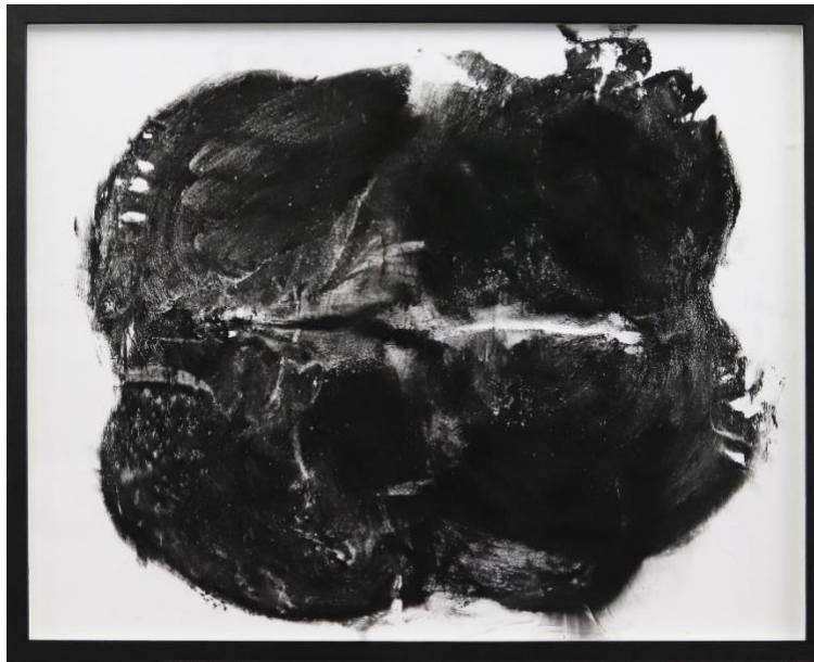
Octoextrema , 2020 Squid ink on silk canvas Framed with Museum Glass 59 x 47 cm