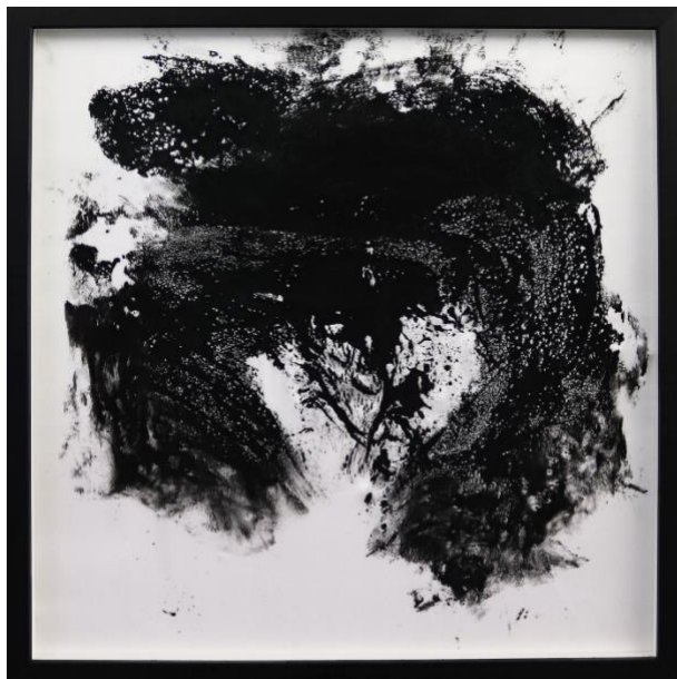
Octoculat, 2020 Squid ink on silk canvas Framed with Museum Glass 39 x 39 cm 11.000 DKK