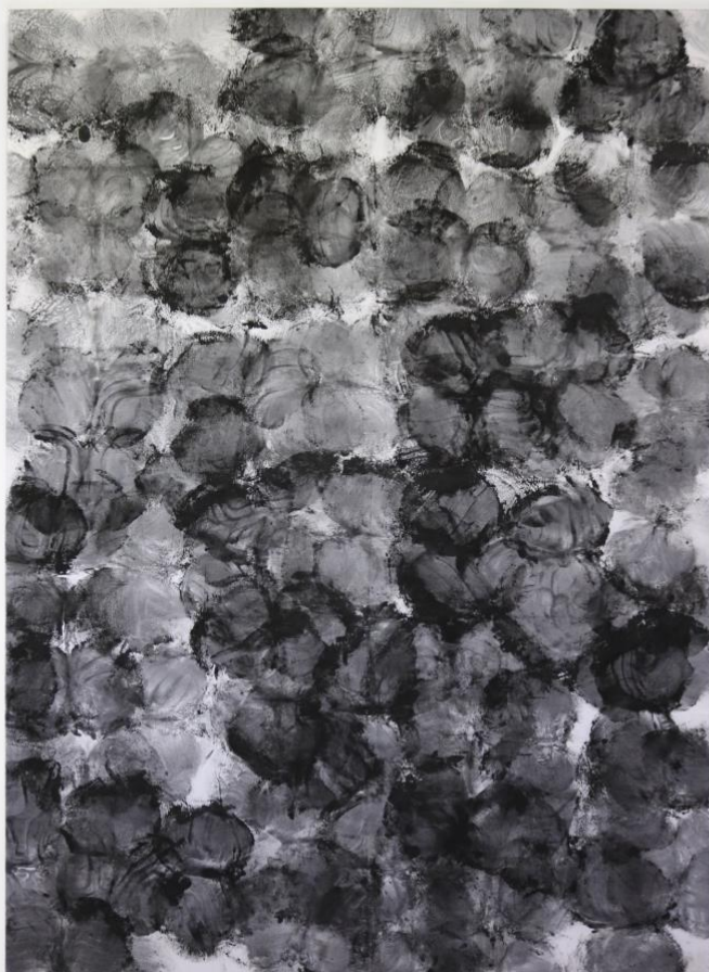
Octocorallia/Squid-Squad monochrome, 2017 Squid ink on silk canvas 130 x 180 cm