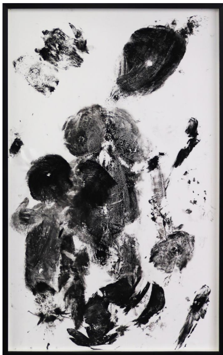
Octocorporis , 2020 Squid ink on silk canvas Framed with Museum Glass 133 x 83 cm