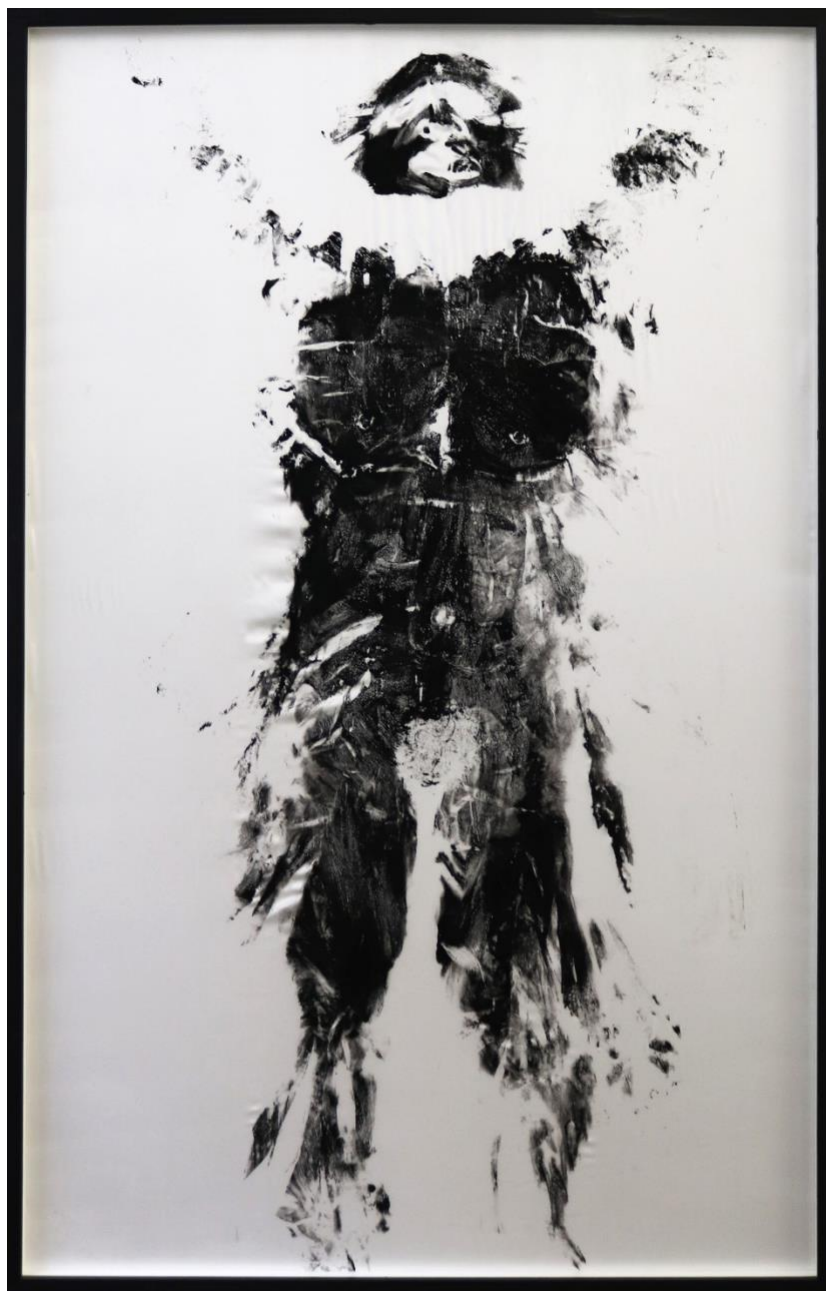
Octorecto , 2020 Squid ink on silk canvas Framed with Museum Glass 163 x 103 cm