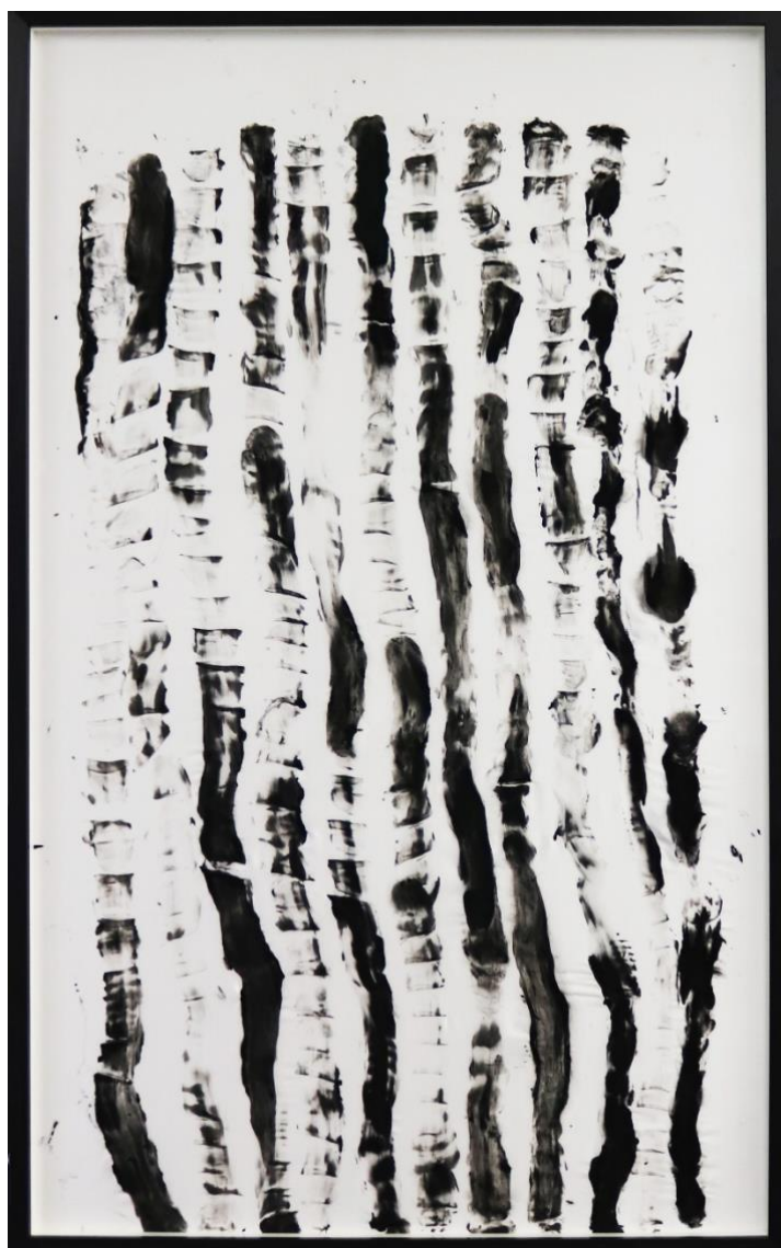
Octolingua , 2020 Squid ink on silk canvas Framed with Museum Glass 133 x 83 cm