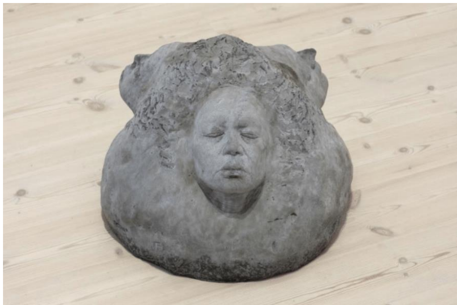
Meteorite , 2019 Concrete 45 X 55 X 60 cm Edition of 3