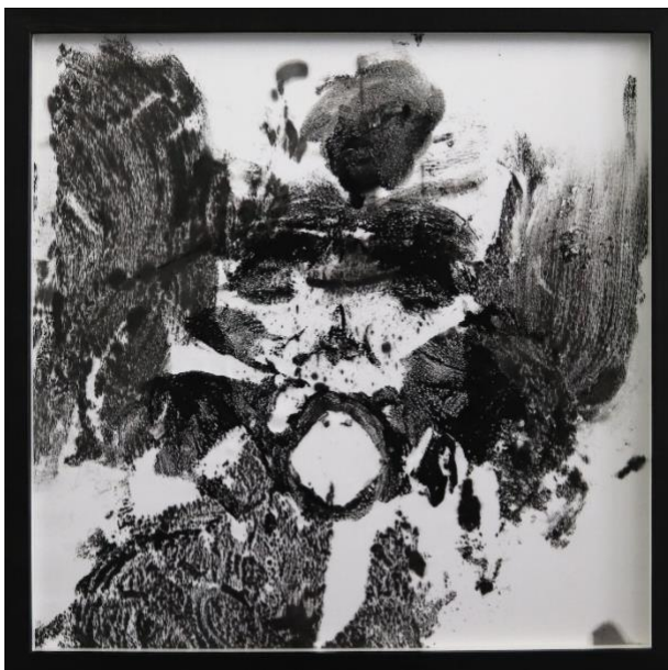
Octofaciem, 2020 Squid ink on silk canvas Framed with Museum Glass 39 x 39 cm