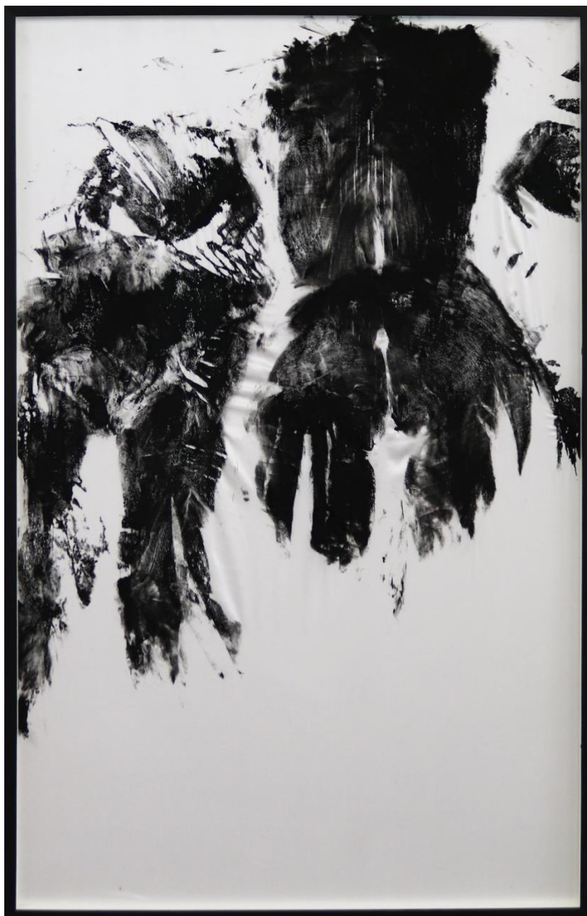
Octoabdomonis , 2020 Squid ink on silk canvas Framed with Museum Glass 163 x 103 cm