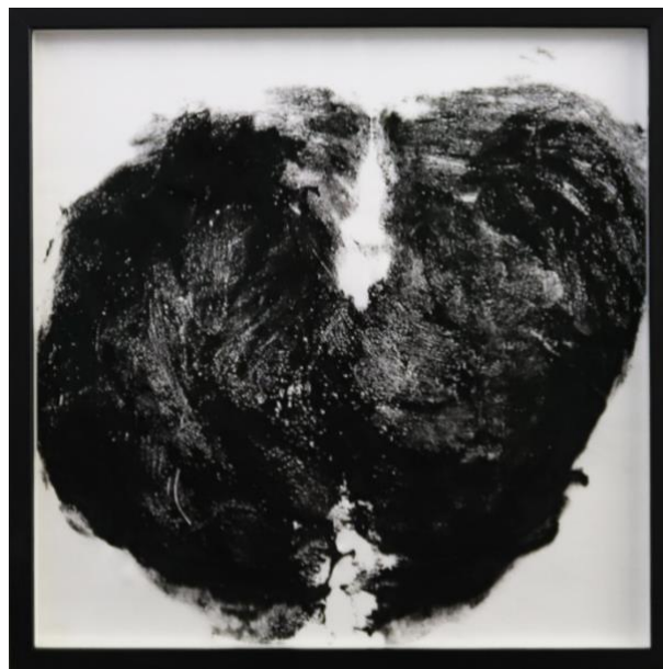
Octobum , 2020 Squid ink on silk canvas Framed with Museum Glass 39 x 39 cm