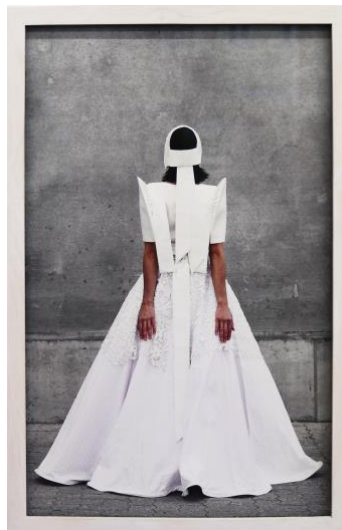
Dragedukker , 2019 Series of 4 photos Hahnemühle print ultra smooth on dibond Edition of 5, 1. A.P. 42 x 27 cm (framed)