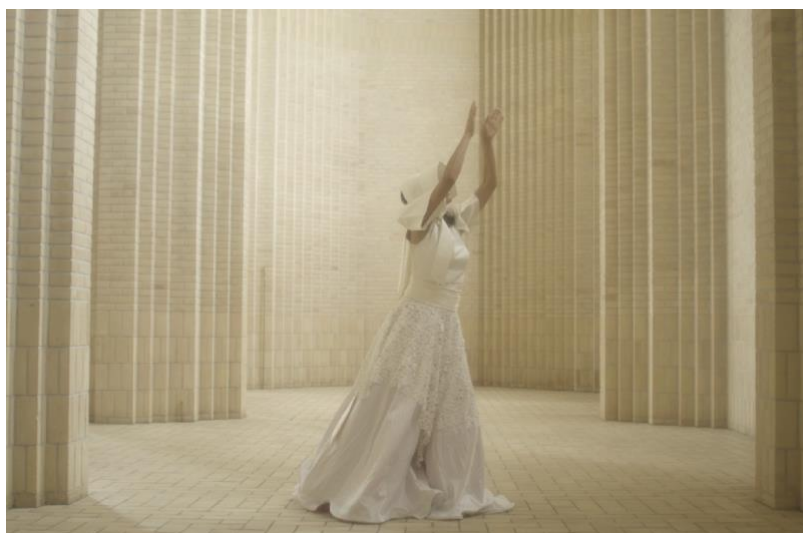
Dragedukke , 2019 Video (loop of 4 min) Edition of 5, 1 A.P