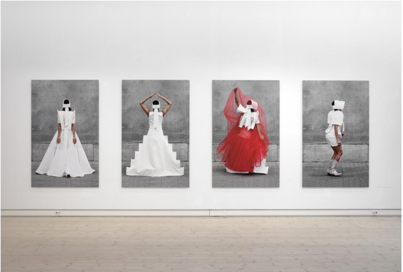
Dragedukker , 2019 Series of 4 photos Hahnemühle print ultra smooth on dibond Edition of 3, 1 A.P. 233 x 150 cm